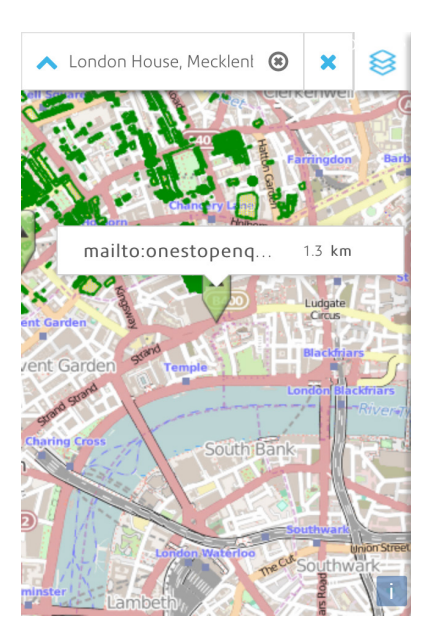
Mini call out: Following a search, the results are minimized to avoid obscuring the map.

Map configuration switcher: Spectrum Spatial Analyst showing the selection of a map you want to view.